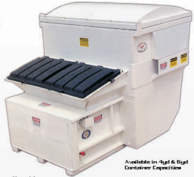
Available in 4yd & 6yd Container Capacities

This compact self-contained unit offers the same liquid tight containment as a standard size compactor but in a more compact size for space limitations. Designed to offer the same benefits of a larger unit with it's optional chute fed or hopper fed system.